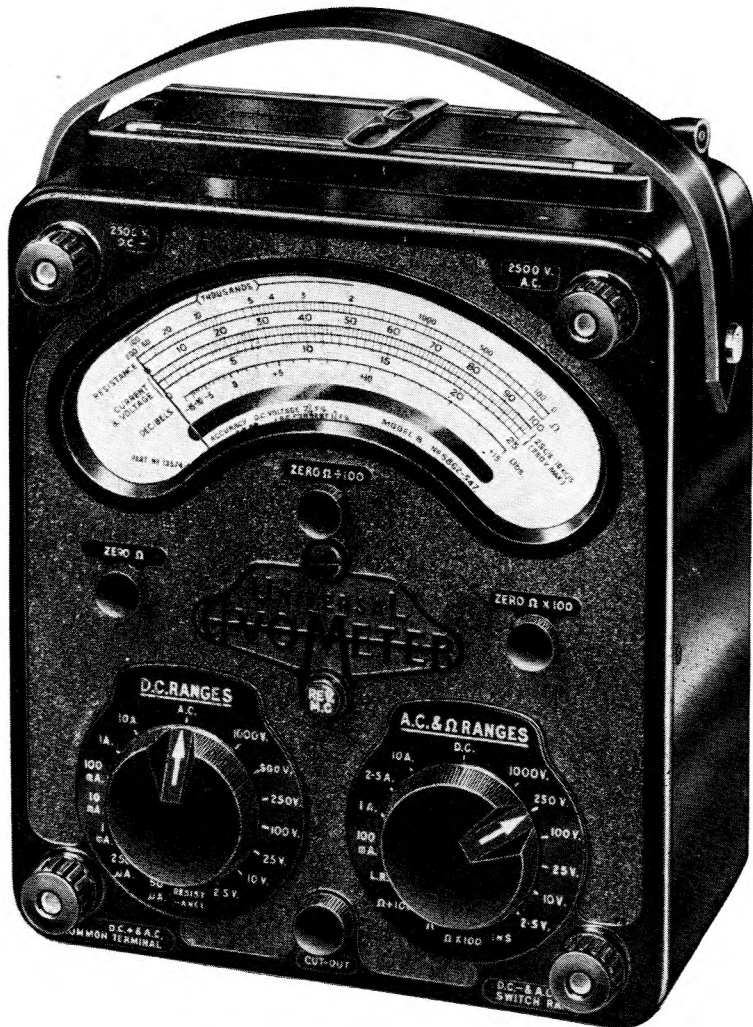
THE MODEL 8 AVOMETER MK. II